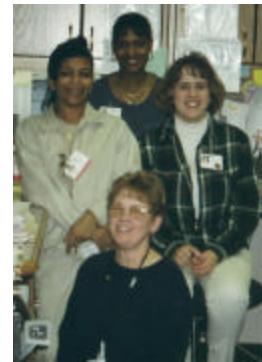
(Above): Some of the smiling, friendly faces of the front desk staff at the Family Practice Center

The Family Practice Center joined the Matrix system in December of last year.